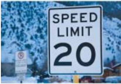
Student Book American English File Starter 2nd edition

27. Choose the option where the sentence best describes the sign.